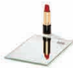
Clear Normal float base