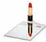
Clearvision Highly neutral float base for pure aesthetics